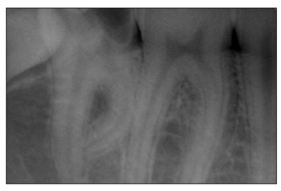
FIGURE 2b: Periapical radiographs showing PEIR.