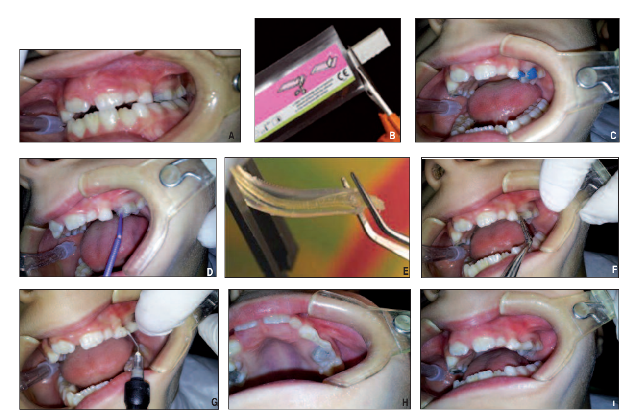
FIGURES 2A-I: Fixed space maintainer with resin-impregnated (pre-preg) FRC.

had been extracted two months earlier (Figure 2A). A fixed-space maintainer using a resin-impregnated FRC (everStick® C&B, Stick Tech Ltd Oy, Turku, Finland) was constructed. The length of the dental arch between the neighboring teeth (63-65) was measured with dental floss, and the required length of 2-mm-wide FRC was cut with the scissors and protected from light to avoid premature curing (Figure 2B). The abutment teeth were cleaned with a non-fluoridated pumice paste, etched with 37% phosphoric acid, rinsed and dried (Figure 2C). Single Bond and a flowable composite resin (Unifilflow, Gc, Tokyo, Japan) were applied to the enamel surfaces (Figure 2D), the FRC was positioned and light cured for 5–10 sec. per tooth (Figure 2E, F). The FRC was coated with flowable composite, the excess composite was removed, and light cured for 40 sec. per tooth (Figure 2G). The occlusion was checked, corrections were made and the composite was polished using a polishing disc (Figure 2H, I).