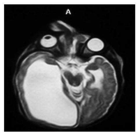
FIGURE 3: A cranial MRI showed Intracranial connection of malformation.

The sincipital group is divided into subtypes as follows: the nasofrontal, which exits the cranium between the nasal and frontal bones; the nasoethmoidal, which exits between the nasal bones and nasal cartilages; and the nasoorbital, which exits through a defect in the maxilla frontal process.<sup>3</sup> A frontonasal encephalocele may be mistaken for a nasal teratoma or glioma. Frontonasal