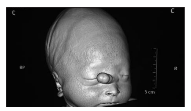
FIGURE 1: Swelling on the nasal dorsum.

Encephaloceles are herniations of the meninges and/or brain which maintain a subarachnoid connection from sutura of the cranium. Frontonasal encephalocele is very rare congenital anomalies. There are a few large series published on the world literature. In one study, 133 case was reported and another study, 187 in 1157 patient with craniospinal congenital malformation were reported to be encephaloceles malformation. Encephaloceles may be included in the fourth groups which comprise occipital, parietal, basal and syncipital groups.