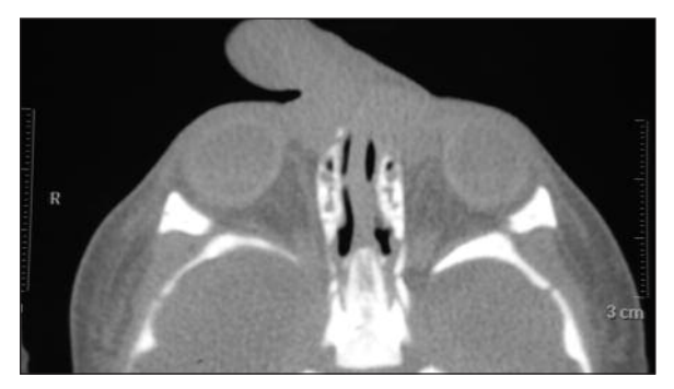
FIGURE 2: Cranial CT showed bone defect.