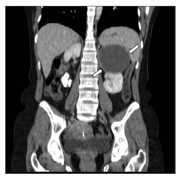
FIGURE 3: Coronal reconstruction of postcontrast abdominal CT shows cystic mass at the left adrenal gland that compresses left kidney and deplaces to inferior (arrows).

0.13%.<sup>2</sup> Because of releasing of catecholamines, approximately 90% of patients with pheochromocytomas present with hypertension.<sup>3</sup> It is reported that more than 90% of patients with a pheochromocytoma will have one or more symptoms of palpitation, diaphoresis and headache.<sup>4</sup>