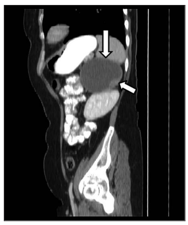
FIGURE 4: Sagital reconstruction of postcontrast abdominal CT shows cystic mass with mural nodule in the wall compressing left kidney (arrows).