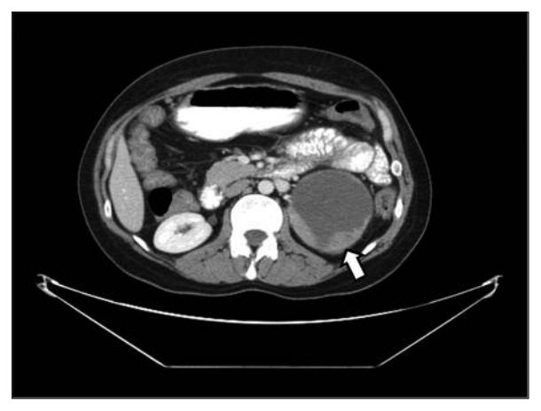
FIGURE 2: Axial postcontrast abdominal CT shows well defined cystic mass and mural nodule within the wall (arrow).