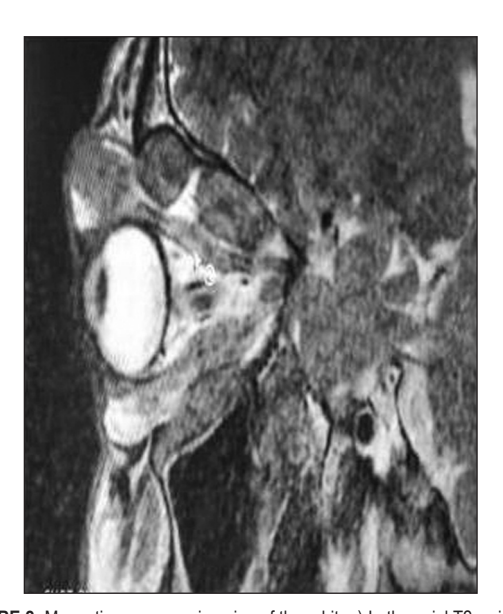
FIGURE 2: Magnetic resonance imaging of the orbit. a) In the axial T2 weighted image, it is seen that both globes are located clearly anterior to the interzygomatic line, consistent with exophthalmos. b) Bilateral size increase and tortiousness in the superior oblique muscles in the axial T2 weighted image are shown by arrows. c) In contrast-enhanced coronal section, marked increase in thickness and enhancement in extraocular muscles are observed almost symmetrically on both sides (arrows). d) Homogeneous enhancement of soft tissue masses in the pterygopalatine fossa are shown by arrows. e, f) Diffusion restriction in the pterygopalatine fossa (arrows) in diffusion-weighted axial image and apparent diffusion coefficient (ADC) mapping, respectively.

IgG4-RD is an autoimmune fibro-inflammatory condition that has recently affected many organs and tissues. It is characterized by elevated serum immunoglobulin IgG4 levels and distinctive histopathological features, including IgG4+ plasma cell infiltration and a fibroinflammatory response.<sup>6,7</sup> IgG4-RD can be seen in many organs such as pancreas, retroperi-